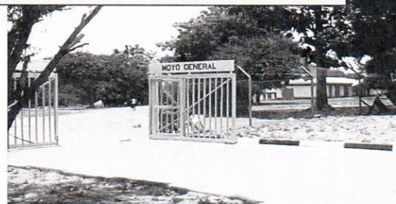
Moyo General Hospital, Uganda